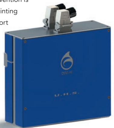
DJM Ultra HS 10 inch print module (example)

Increase your flexibility and uptime for more profitability. The optimized recirculation around the nozzles reduces cleaning maintenance. In most cases spit bars are not needed. As a result of recirculation nozzle open time is improved. No specific inkjet knowledge is needed to operate the system. Also minimal operator intervention is required to run the inkjet printing system. Set-up times are short and there is no downtime during production when filling the ink supply. The DJM Ultra HS runs without click charges and no refurbishing routines are required. All these qualities will save time and costs.